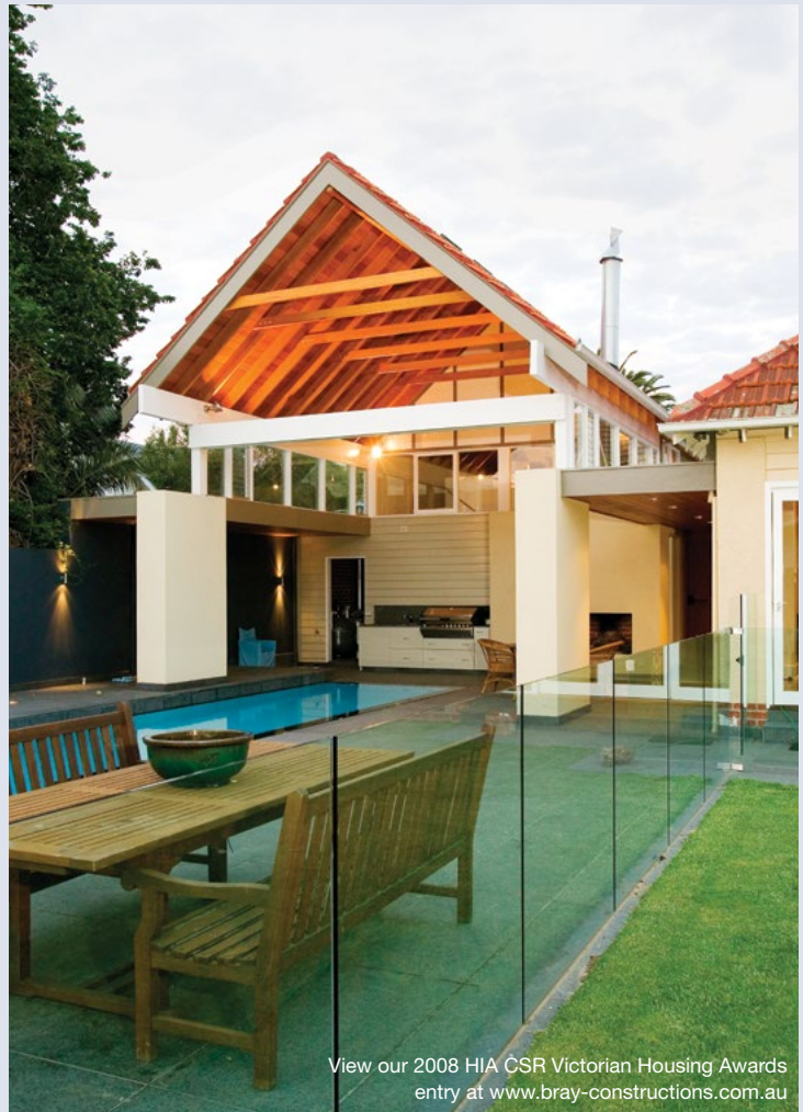
View our 2008 HIA CSR Victorian Housing Awards entry at www.bray-constructions.com.au

New electrical regulations are also upon us with a key part of that being that regular low-voltage downlights must now be shielded (including a mandatory clearance) to prevent any contact with insulation or other combustible materials. Apart from the obvious safety intention of this particular regulation, it will also generate a push towards energy efficient compact fluorescent downlights. Compact fluorescent downlights do not put off any heat and do not require the same shielding, meaning that they will be better suited to ceilings with confined spaces above.