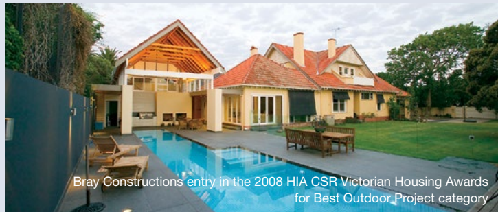
Bray Constructions entry in the 2008 HIA CSR Victorian Housing Awards for Best Outdoor Project category

As seems to regularly be the case now, we are enjoying exciting and busy times at Bray Constructions with a lot happening in all areas of our business. We have steadily been expanding our team over the past 12 months, both on site and in the office. Our growing team affords us opportunities to better serve current and new customers alike with a broader set of skills and experience among our ranks.